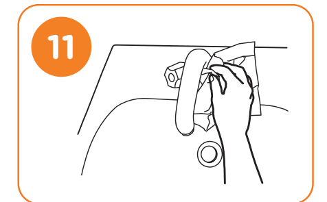
Use single use towel or piece of tissue to turn off tap